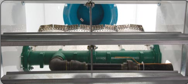
AUTOMATIC MULTI-POSITION VARIABLE PROFILE DAMPER FOR SUPPLY AIR CONTROL AND OPTIMUM FLAME EFFICIENCY