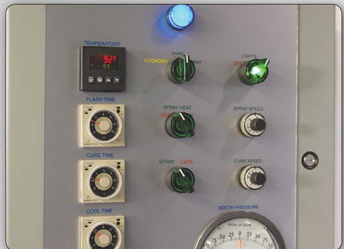
CONTROL PANEL WITH VFD ENERGY-SAVINGS ECONOMY "PREP" MODE, DIGITAL MICROPROCESSOR, PID, DUAL SET POINT TEMP CONTROL