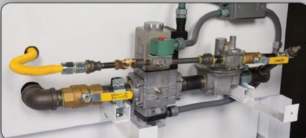
MOTORIZED GAS CONTROL TO REDUCE POSSIBLE RAPID TEMPERATURE FLUCTUATIONS