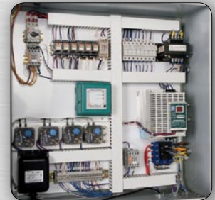
UL-LISTED DIGITAL CONTROL PANEL THAT MANAGES MULTIPLE FUNCTIONS